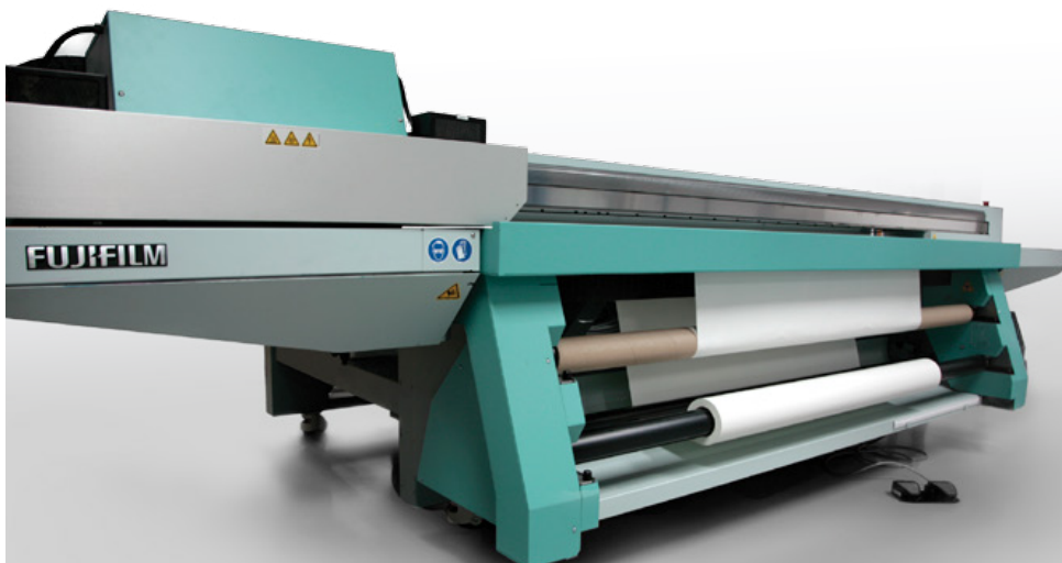
Roll media option

The Acuity flatbed platform has been the industry benchmark since 2007 – with thousands of machines installed worldwide. The Acuity 15 features the same robust, dedicated flatbed configuration with the latest inkjet technology and engineering developments to deliver consistent quality and reliable performance. And through an excellent service infrastructure, Fujifilm provides world-class support before, during and after installation.